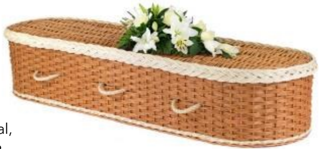
English Willow eco2 Round and Traditional, various colours £568

English willow coffins in different styles and many colours: handwoven from sustainable willow grown on the Somerset levels, colours created by natural methods of drying, boiling or bark stripping.