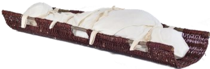
Bamboo shroud and willow stretcher £462