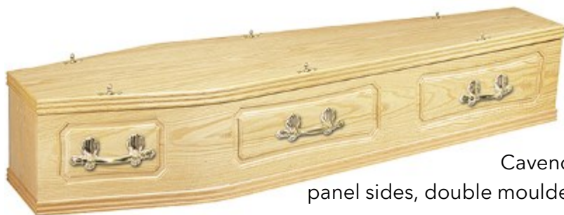
Cavendish oak panel sides, double moulded, solid