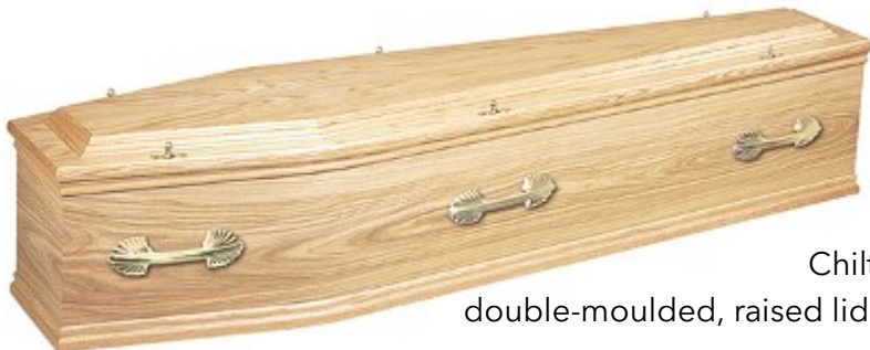
Chiltern oak double-moulded, raised lid, veneer £420