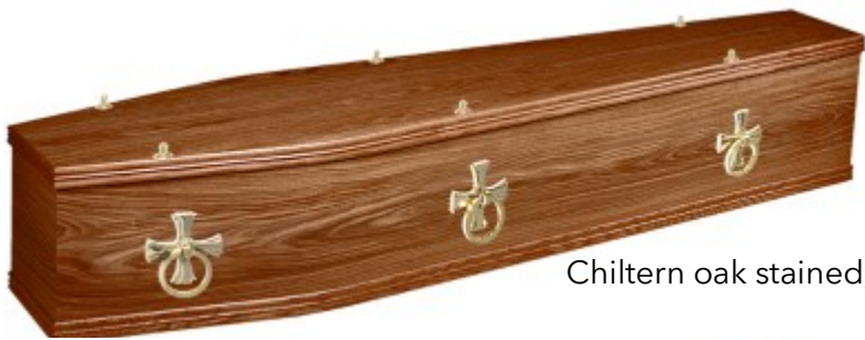
Chiltern oak stained, veneer £332