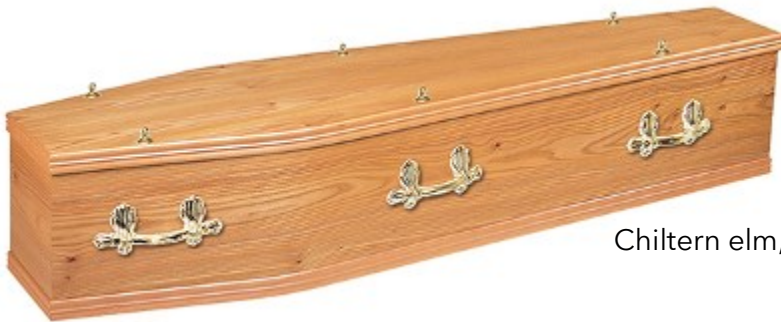
Chiltern elm, veneer £308