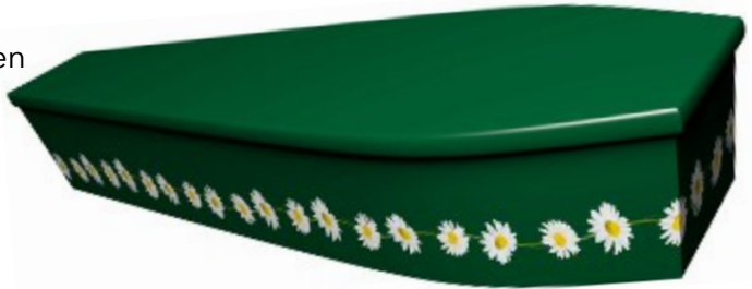
British Daisy Green £655