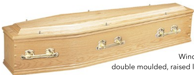
Windsor oak double moulded, raised lid, solid