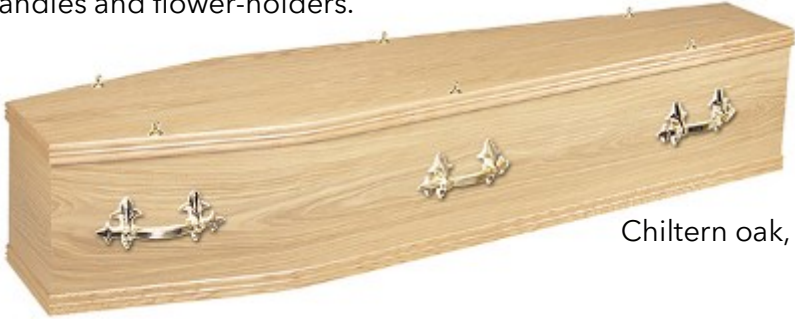
Chiltern oak, veneer £308

Wooden coffins in different styles and many colours: prices include handles and flower-holders.