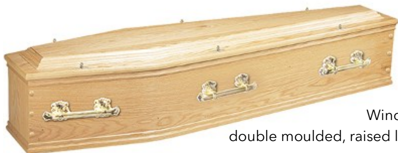
Windsor oak double moulded, raised lid, solid £722