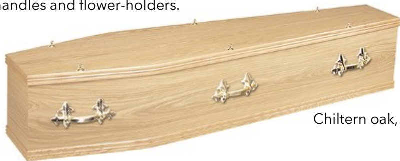
Chiltern oak, veneer

Wooden coffins in different styles and many colours: prices include handles and flower-holders.