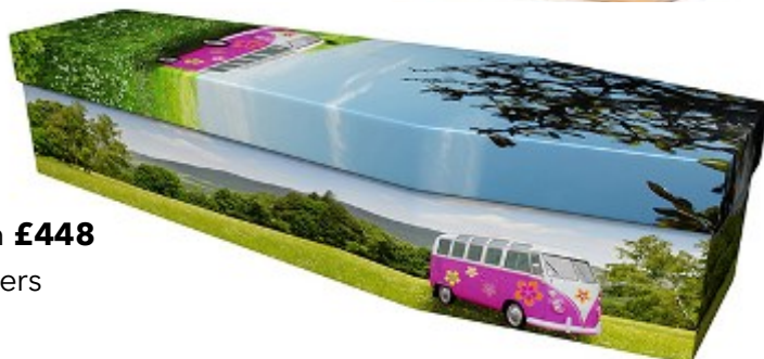
VW camper van £448 - plus many others