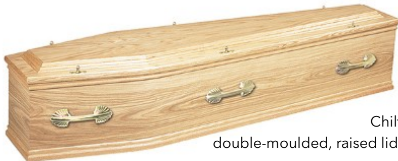
Chiltern oak double-moulded, raised lid, veneer