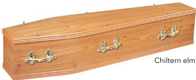
Chiltern elm, veneer