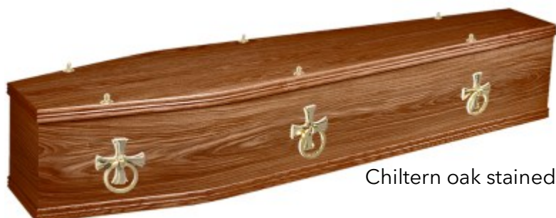
Chiltern oak stained, veneer